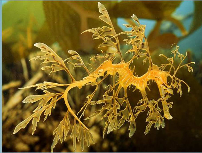
Leafy sea dragon