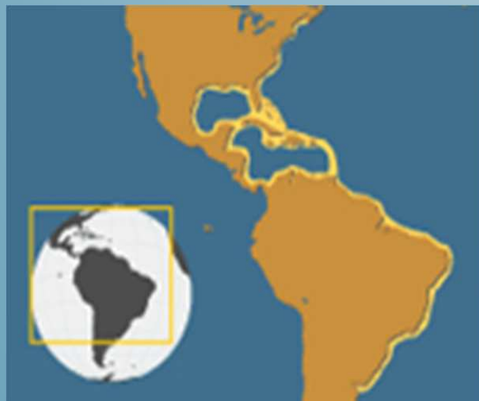
Blue Crab Range