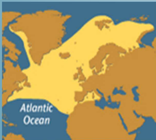
Atlantic Bluefin Tuna Range