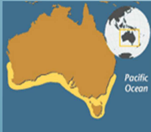
Leafy and Weedy Sea Dragon Range