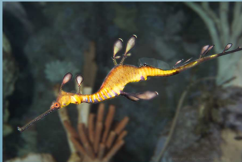
Weedy sea dragon