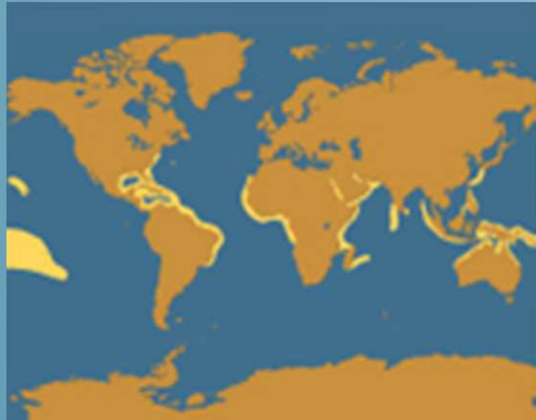
Butterfly fish Range